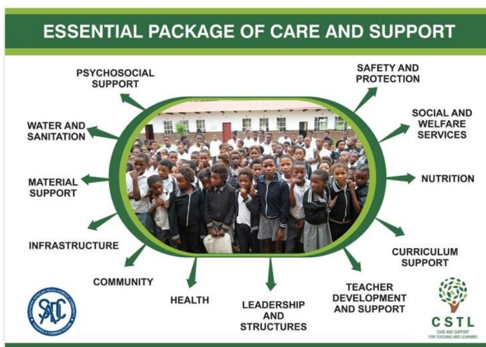
Figure 1: Essential elements in a caring and supportive school

63. Through the CSTL initiative, policies, structures and systems are developed or reviewed at national and sub-national levels, so that they facilitate and support interventions that: